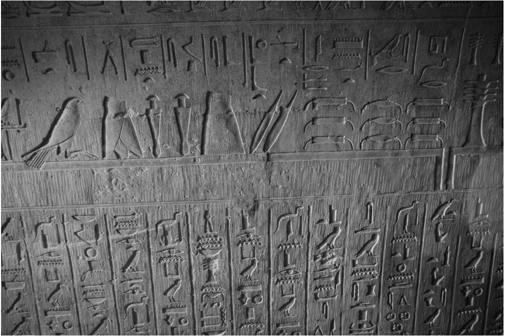
3. Third part of the object frieze in the burial chamber of Menekhibnekau (Phot. M. Frouz).