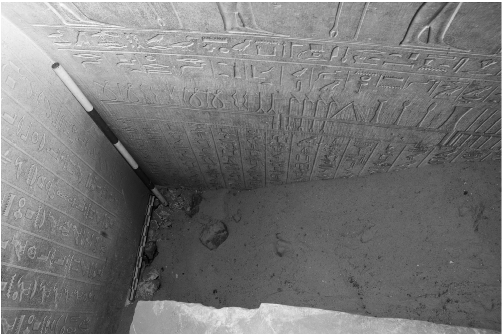
4. End of the object frieze in the burial chamber of Menekhibnekau (Phot. M. Ottmar).