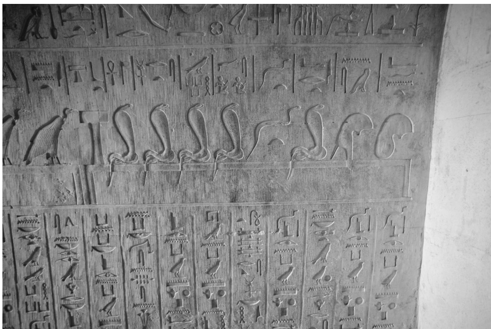
1. Beginning of the object frieze in the burial chamber of Menekhibnekau.